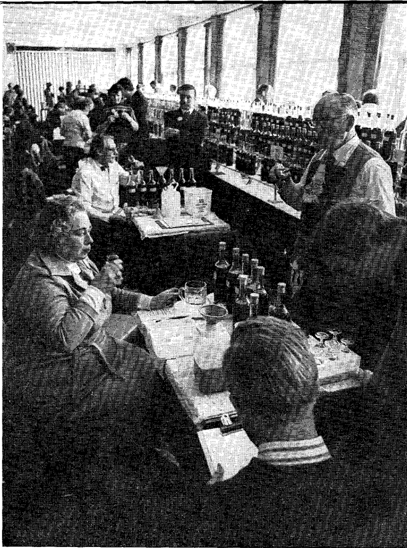
A general view of the judging.